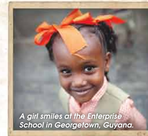
A girl smiles at the Enterprise School in Georgetown, Guyana.